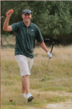
Chapter Golf Tournament Fun For All. See page 2

promoting professionalism and advancing awareness of the landscape industry