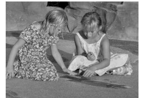
Above: Underwater Map at the San Diego – La Jolla Underwater Park and Ecological Reserve. At left: LithoMosaic at North Island Credit Union.